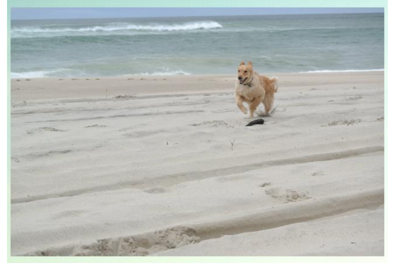
Posted by Leah Klein, guest blogger of Leah's Life: Pearls & Oysters

This weekend, I saw some of the happiest couples strolling down Tremont Street in Boston's South End. The couples looked into each other's eyes as they meandered through a stream of people on Newbury Street. The pairs basked in the sun together amid the pink petals swirling down from the trees in the Boston Garden. These couples were six-legged couples, they were dogs and their owners glad to be outside together. As the sun heats up even more, the ocean beckons and you don't have to leave your four-legged BFF at home. Here are some great places to Sit (and enjoy a bite to eat or a great view). Stay (pet-friendly lodging) and Play (hikes, beaches, and more play spaces) with your dog on Cape Cod.