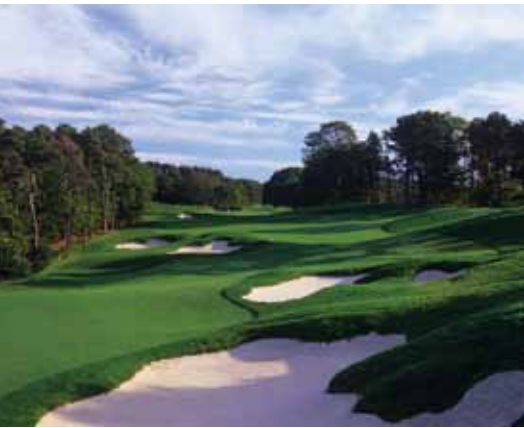
Golf Course at Ocean Edge Resort.