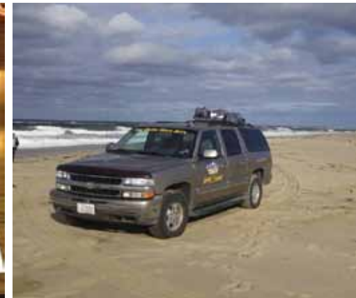
Art's Dune Tour.

wireless transmission took place in 1903. The original buildings and structures have long succumbed to merciless winter storms, but a couple of plaques commemorate the monumental achievement that ushered the wireless era to the world. www.nps.gov/caco .