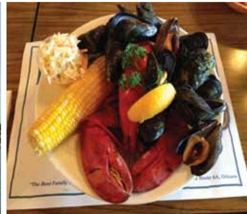
Clambake at Lobster Claw.