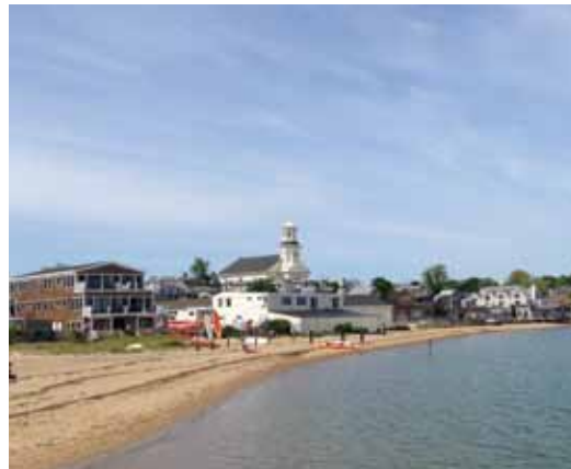
Skyline of Provincetown.